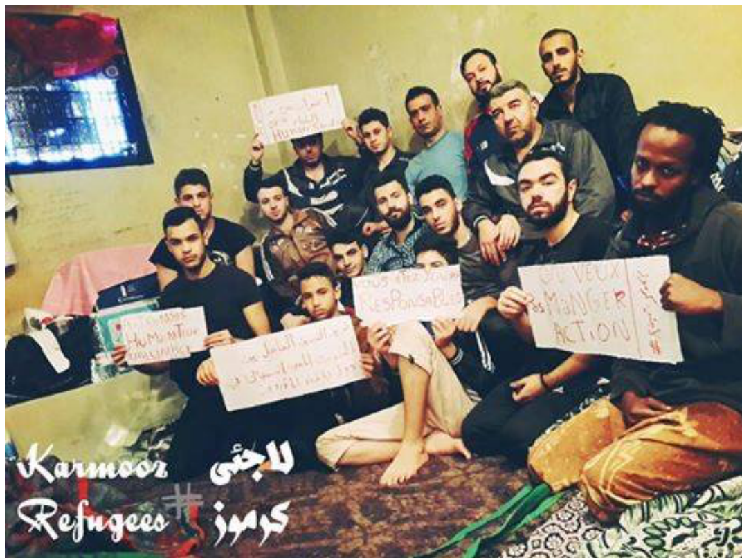
Refugees detained in Karmouz Police Station (Alexandria) between 2014-2015 used an advocacy campaign on social media channels to call for their release from detention and resettlement to European countries.

However, a growing number of observers recognise that social media and other online platforms can give agency back to refugees, asylum seekers, and migrants in a world of borders and fences that aim to strip them of that agency. Social media can allow people to make better-informed—possibly life-saving—decisions. This Global Detention Project (GDP) Special Report is aimed at improving our understanding of how refugees, asylum seekers, and migrants use social media and other tech apps during their migration journeys, with a special emphasis on the use of these media in the context of detention and migration control in North Africa and the Mediterranean.