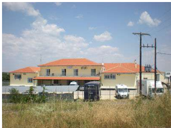
Fylakio pre-removal detention centre