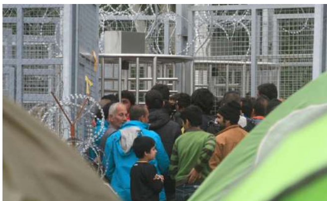
Tompa Transit Zone Detention Centre