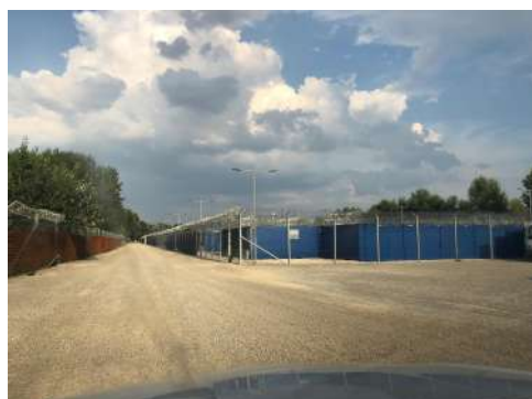
Roszke Transit Zone